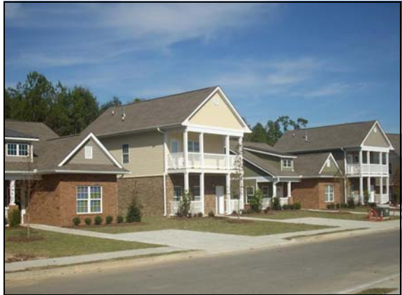
The Waterford | Dublin, GA Completed December 2010