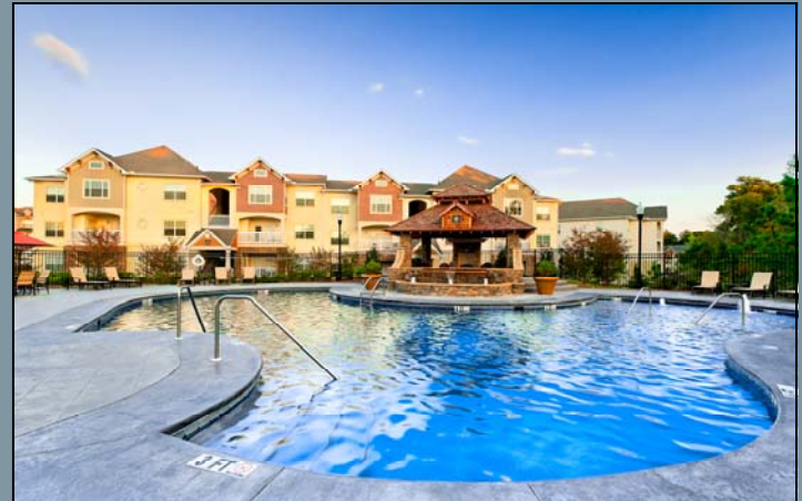
The Preserve at Columbus Park | Columbus, Georgia 224 Multifamily Units Completed 4th Quarter 2010 for G.M. Adams, LLC Architect - Pucciano & English, Inc.