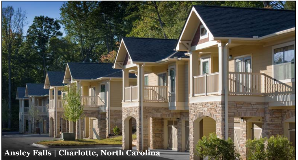
Ansley Falls | Charlotte, North Carolina