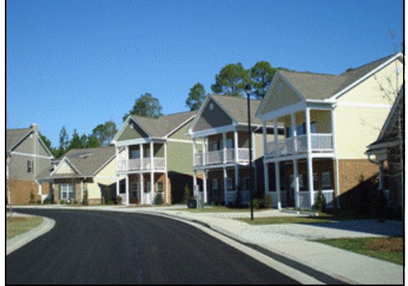
Rosewood Estates | Cordele, GA Completed December 2010

770-448-7047 X 309 tsmith@hathawayconstruction.com