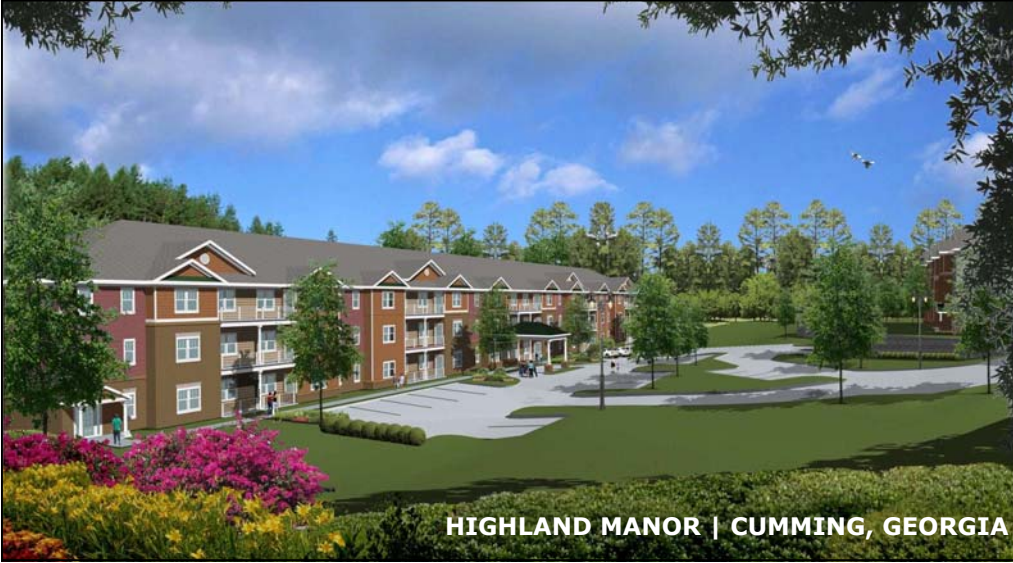
HIGHLAND MANOR | CUMMING, GEORGIA